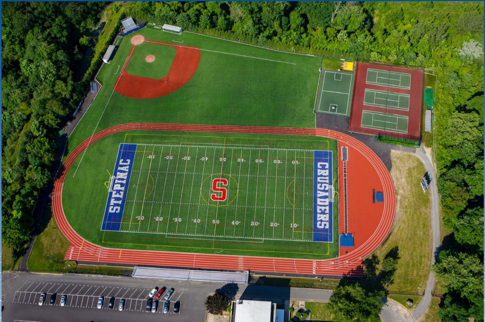
Similar Field Configurations