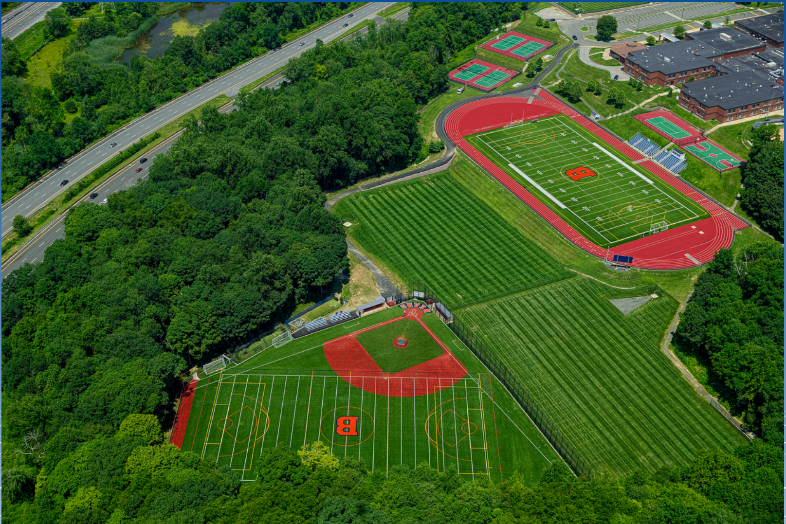
Similar Field Configurations