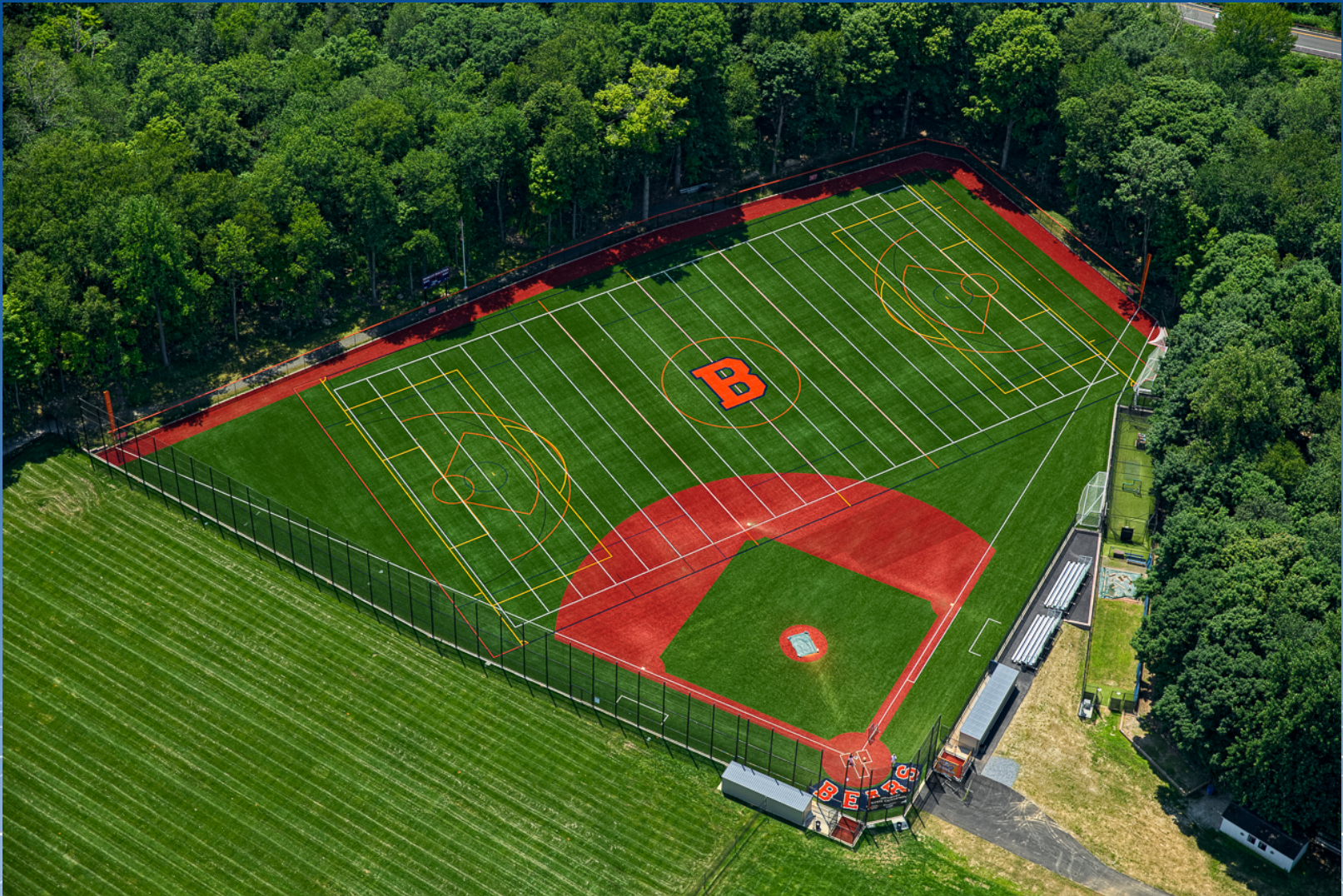
Similar Field Configurations